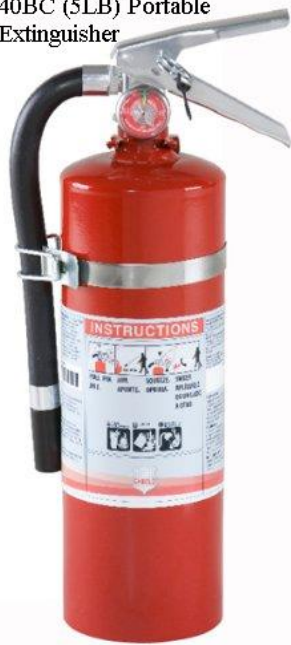
40BC (5LB) Portable Extinguisher